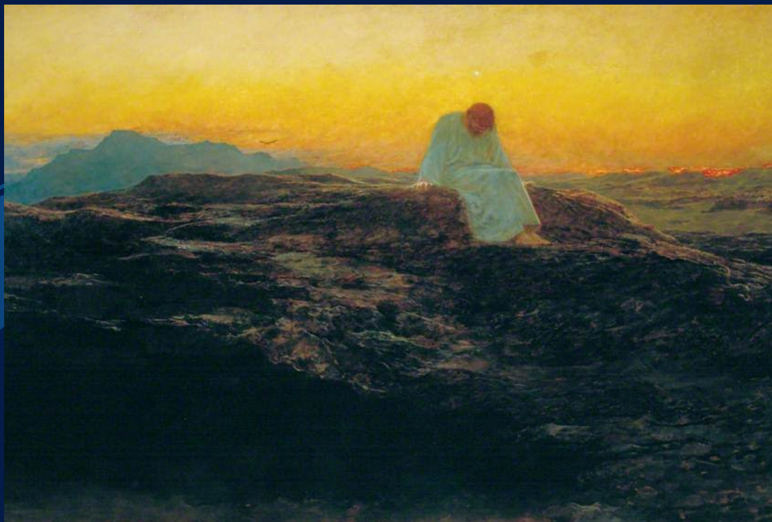
The Temptation in the Wilderness Briton Rivière (1840–1920)

The Sundays of Lent in this cycle rehearse the history of God's covenant-making with his people. On this first Sunday, we hear of the covenant of God with Noah, the new creation begun after the great destruction of the flood. God will not be defeated by human weakness and failure. Although his children fall, he returns to establish his bond with them. Jesus comes from the waters of the Jordan to seal once and for all in his blood the covenant of God with his people.