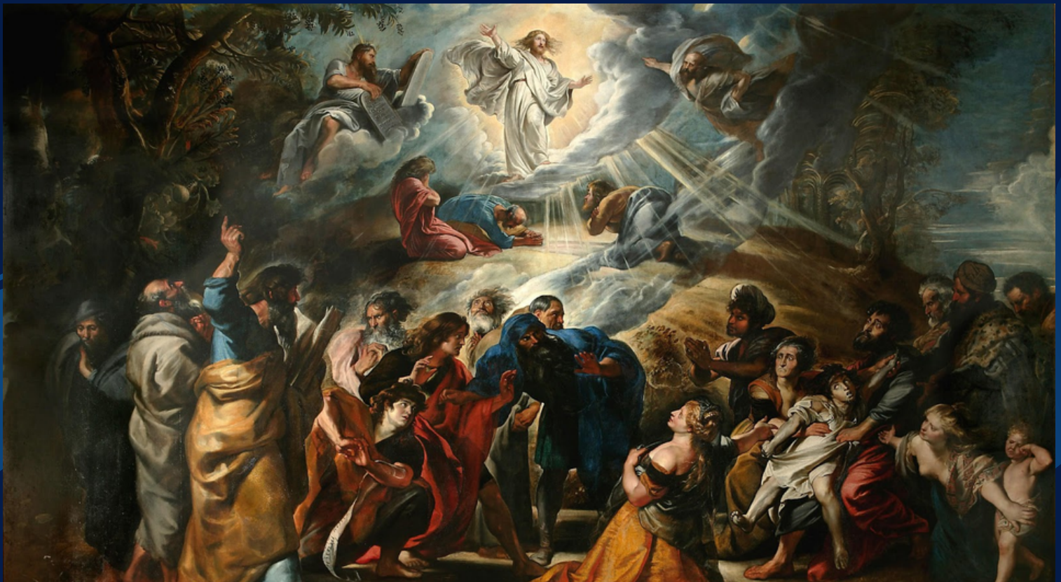
The Transfiguration Peter Paul Rubens (1577-1640)

Every year the first two Sundays of Lent present the whole gamut of human existence, the whole range of the history of salvation. On the first Sunday of Lent the temptation of Jesus recalls the temptation of every human being since the beginning. On this second Sunday of Lent the transfiguration of Jesus holds out the transformation in glory which is the goal of every human hope.