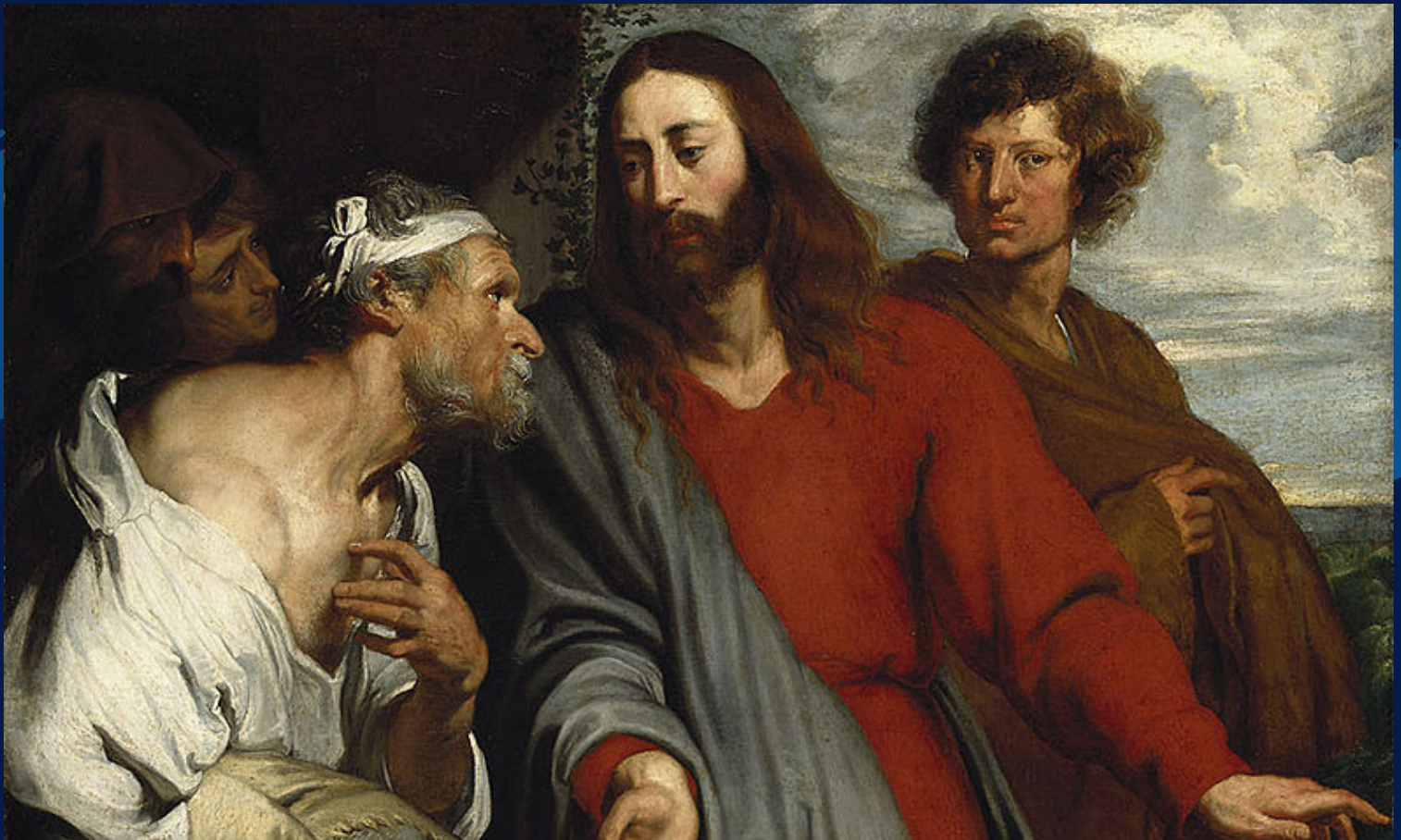
Healing of the Paralytic Anthony van Dyck (1599–1641)

The cure of Peter's mother-in-law suggests more than Christ's extraordinary power over a sick body. Mark demonstrates his interest in the event's meaning in a clipped account: the healing of bodies is aimed at the wholeness of spirits. This same narrative implies a model for every believer. Made whole by the power of Jesus, we too must devote our full energy to serving the Lord.